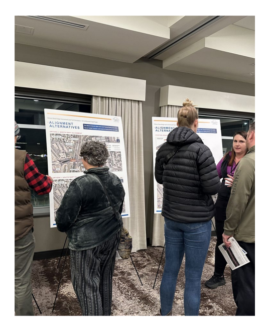
Figure 1. Pictures from the in-person open house on Tuesday, November 19, 2024.