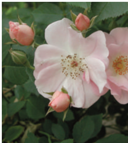
Flower Girl, S, is available at our PPRS Rose Sale.